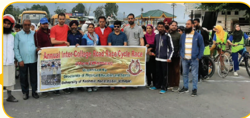
50 girl students participated in Inter-College KU Inter-College Cycle Race