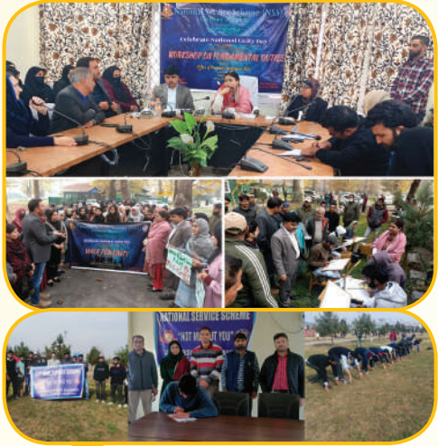
Celebrations related to National Unity Day at Main, South Campus