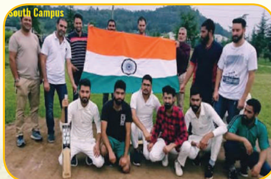
Event at South Campus