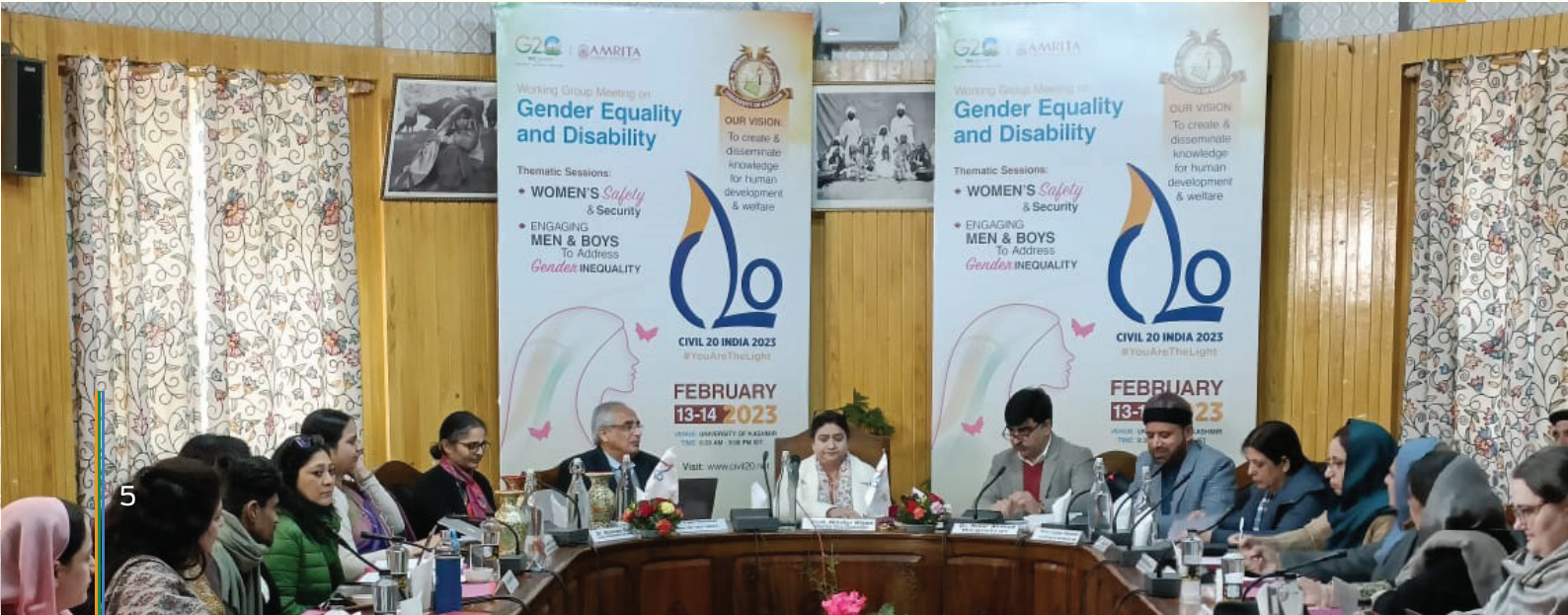
Two-day C20 Working Group Meeting on 'Gender Equality and Disability' at KU