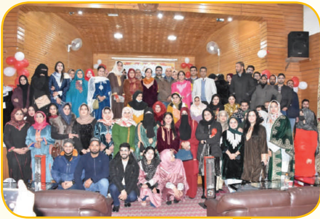
KU's Social Work Department organises alumni meet