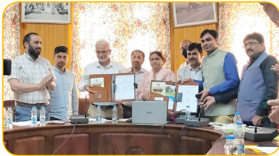
KU signs MoU with IIS, Gujarat University, to promote innovations and action-oriented research

In order to meet the challenge of linking academia with the Industry and other institutions of national importance, the University of Kashmir signed important pacts during 2022 in areas of legal studies, innovations and scientific collaborations. Shared learning and exchange of ideas and expertise is one of the thrust areas of National Education Policy-2020.