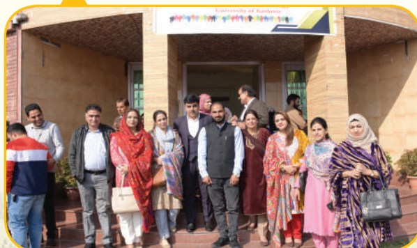
KU's Sociology Department organises maiden alumni meet