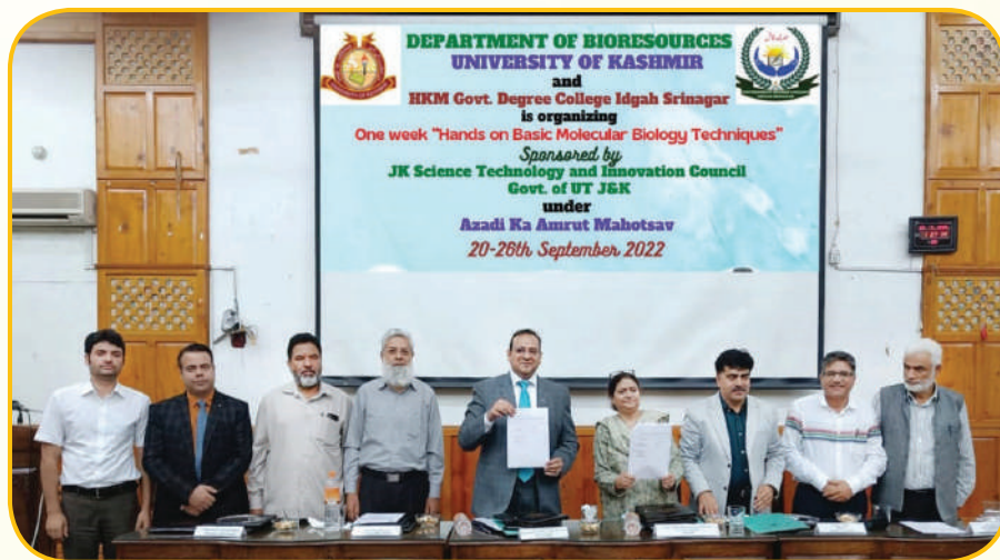
A glimpse from MoU-signing ceremony between KU and J&K Science Technology and Innovations Council (JKST&IC)