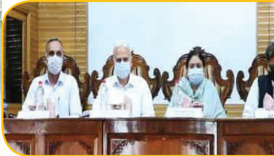
Department of Food Science and Technology organised a 3-day international conference on 'Interface between Agriculture, Food, Chemical and Biological Sciences'