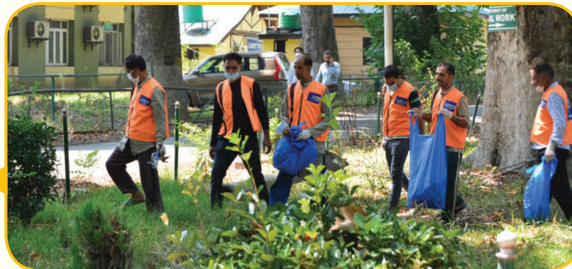
NSS KU organises a mega cleanliness drive