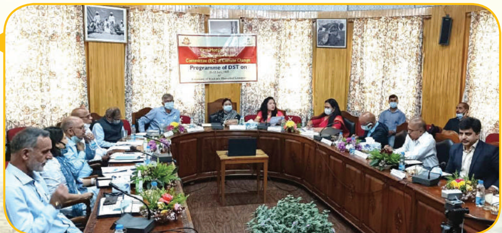
Eminent scientists during the first meeting of Reconstituted Committee of Climate Change Programme of the DST at University of Kashmir