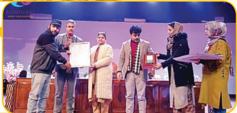
Vice-Chancellor inaugurates TechFest Roshnaas, organised by Institute of Technology, Zakura Campus.