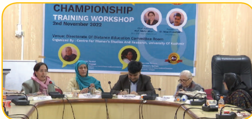
A glimpse from meeting of Gender Champions Club