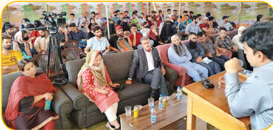
A mental health awareness programme at Institute of Technology, Zakura Campus