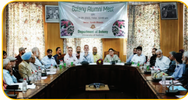
Eminent academics in attendance at KU Botany Department alumni meet