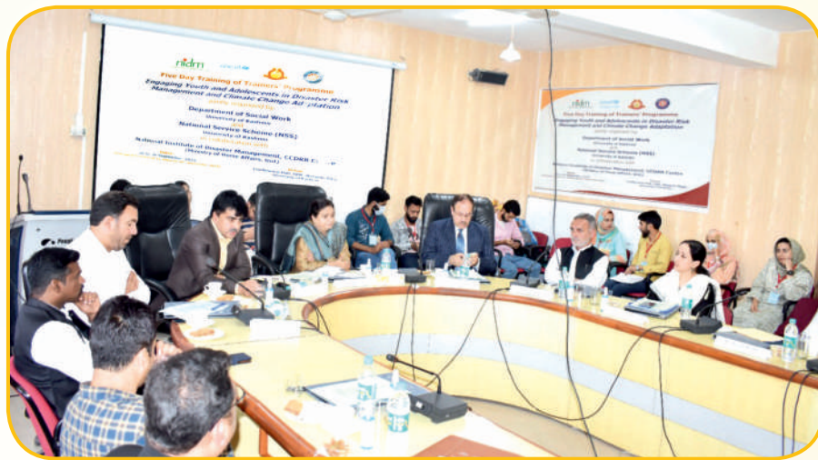
Department of Social Work, NSS and NIDM organise joint workshop on 'Engaging Youth and Adolescents' in Disaster Risk Reduction

The University of Kashmir continued to hold environment protection campaigns, events and seminars at the main and satellite campuses. In view of the importance of engaging students in disaster management programmes, the University laid added focus on disaster risk reduction. The University of Kashmir also bagged the Union Education Ministry's 'District Green Champions' Award 2021-22.