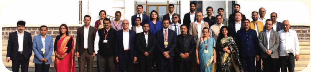
Registrar KU participated in Youth20 Initiation Workshop at IIM Raipur