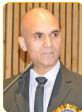
KU Scientist Elected Member of National Academy of Sciences