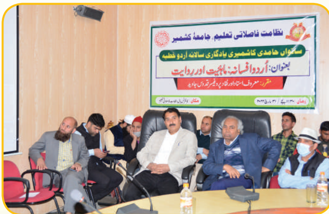
Directorate of Distance Education organised 7 th Hamidi Kashmiri Memorial Lecture