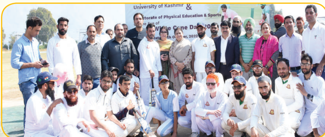
Specially-abled students participate in Para Cricket Match on the occasion of World White Cane Day