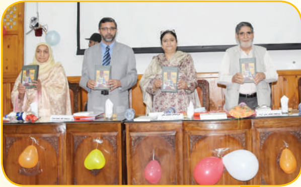
'Milan-2022': KU's Urdu Department organises its first alumni meet

R ealising the importance of a strong student-institution relationship, a number of alumni meets were held at the University of Kashmir on directions of Vice-Chancellor. One of the important parameters in the universities' NAAC assessment is the number of alumni meets held and engagement of the former students with the institution.