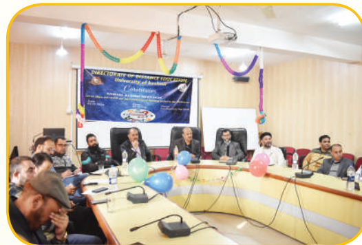
Alumni meet held at KU's Distance Education