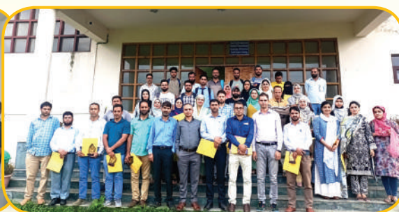
Students and faculty during Teachers' Day celebrations at KU's Main, South campuses