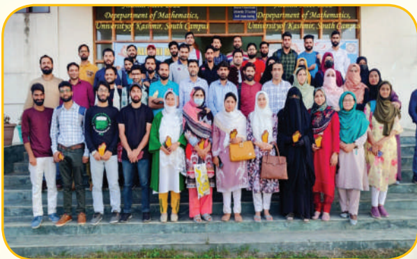
Alumni meet held at KU's South Campus