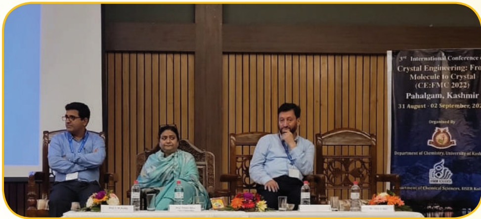
Department of Chemistry KU in collaboration with Department of Chemical Sciences, IISER Kolkata, organised 3rd International Conference on Crystal Engineering at Pahalgam, Kashmir.

From witnessing the appointment of first woman Vice-Chancellor to securing 110 th rank in South Asia in the QS Asia University Rankings, the University of Kashmir achieved many a milestone in academics, research and extension activities. Besides hosting three international conferences in the disciplines of Food Science and Technology, Crystal Engineering and Cell Biology, the University hosted top-notch scientists from across the country for a dialogue on climate change. And the first time, Korean Ambassador to India visited the University to vow partnership in 'areas of mutual interest'. The University was also selected to participate in PM's Mission Amrit Sarovar, a flagship initiative of the Honourable Prime Minister on rejuvenation of water bodies across the country. The University has also become part of a key UN report on sustainable use of wild species.