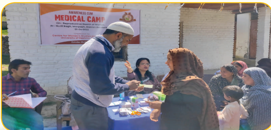
CWSR organised several outreach programmes on women's health and hygiene in different areas of Kashmir