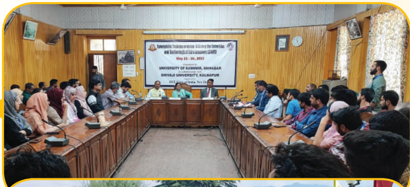
Department of Physics University of Kashmir organised week-long 'Synergistic Training Programme Utilising the Scientific and Technological Infrastructure' in collaboration with Shivaji University, Kolhapur. It was sponsored by the Department of Science and Technology, Government of India.

In the year 2022 some 600 research papers were published by our faculty in indexed journals notified by UGC with good impact factor.