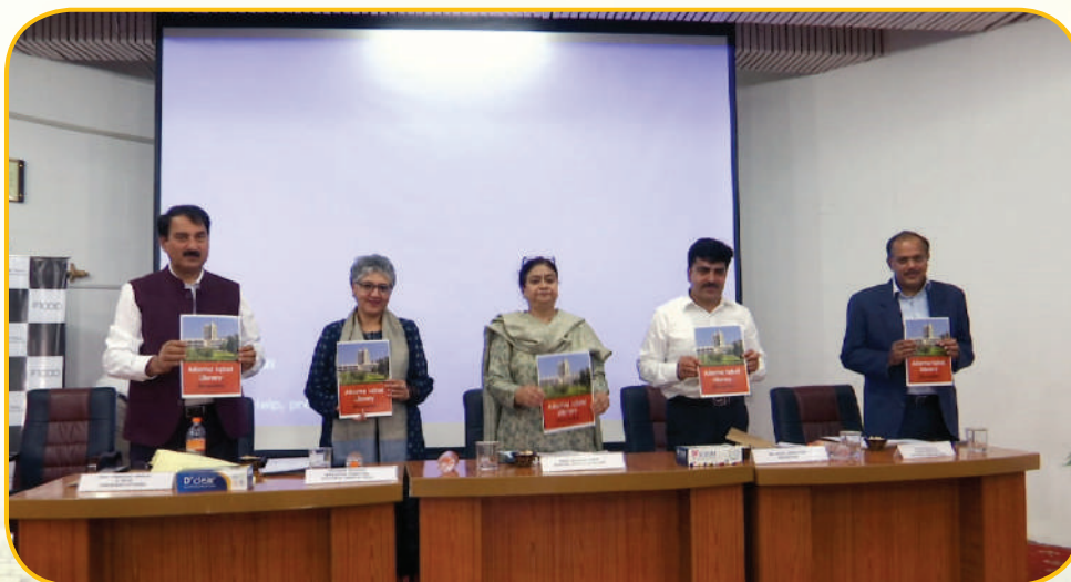
Vice-Chancellor chairs national workshop on 'How to Publish Scholarly Books and Open Access' organised by Allama Iqbal Library (AIL) in collaboration with Taylor & Francis