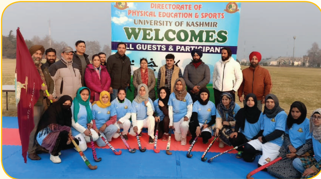
Vice Chancellor flags off student teams for Inter University North Zone tournaments

Having significantly added new infrastructure and facilities in the area of sports, the engagement of students from teaching departments and affiliated colleges in different sports events at the local and national level gained pace during the academic year 2021-22. Besides tournaments in Cricket, Football, Volleyball and Badminton, the University organised a Para Cricket Match to mark the World White Cane Day. In these tournaments, the participation of girl students from teaching departments and affiliated colleges was significantly visible.