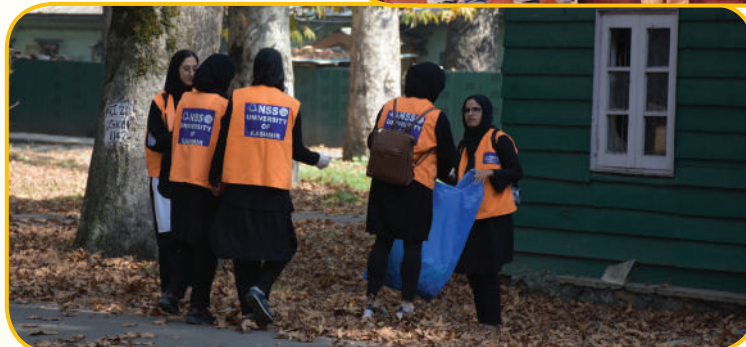
500 NSS volunteers joined Clean India Campaign 2.0 at University of Kashmir