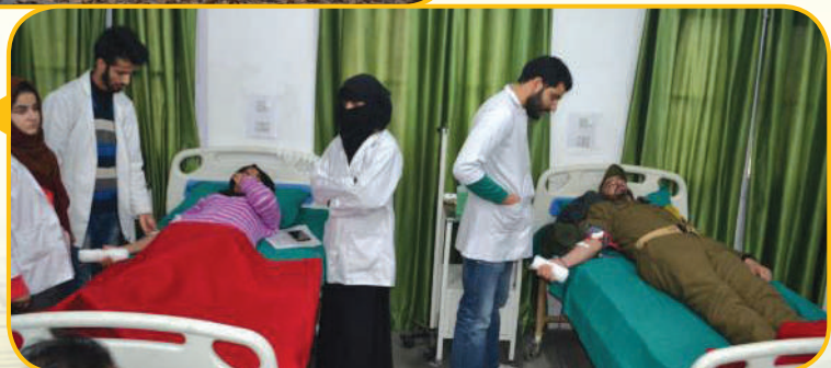
NSS student volunteers donate blood during a blood donation camp organised to mark World Blood Donation Day