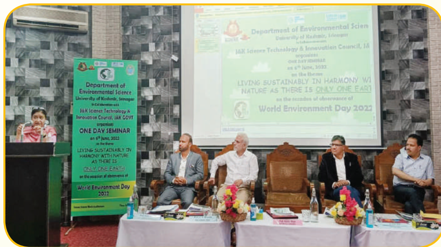
Department of Environmental Sciences and JKST&IC organised series of events on 'Living Sustainably in Harmony with Nature as There is Only One Earth'.