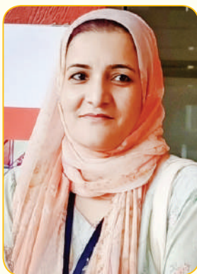
KU teacher bags SERB-POWER Fellowship